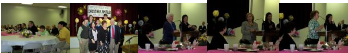
Family and Friends made the evening special with many compliments and inspiring stories.