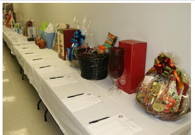
2011 SILENT AUCTION

The Caterers and Vendors in attendance are as follows: