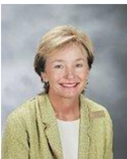
Griggs Elementary School